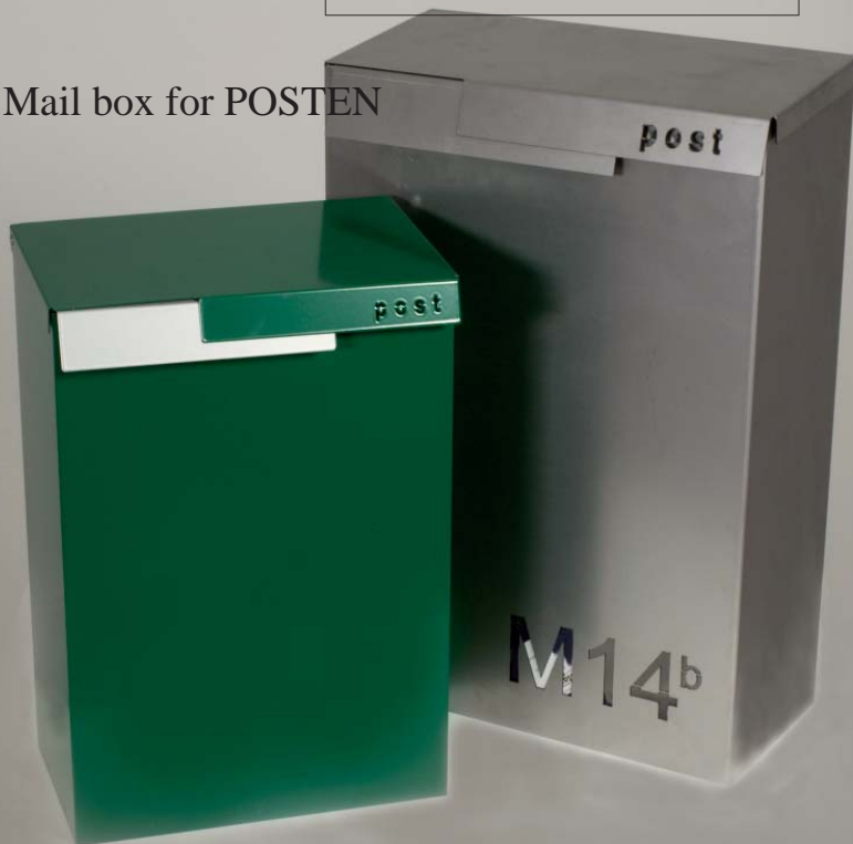
Mail box for POSTEN