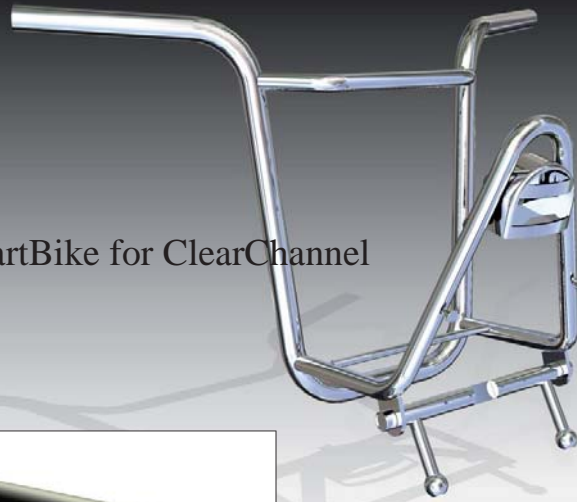
SmartBike for ClearChannel